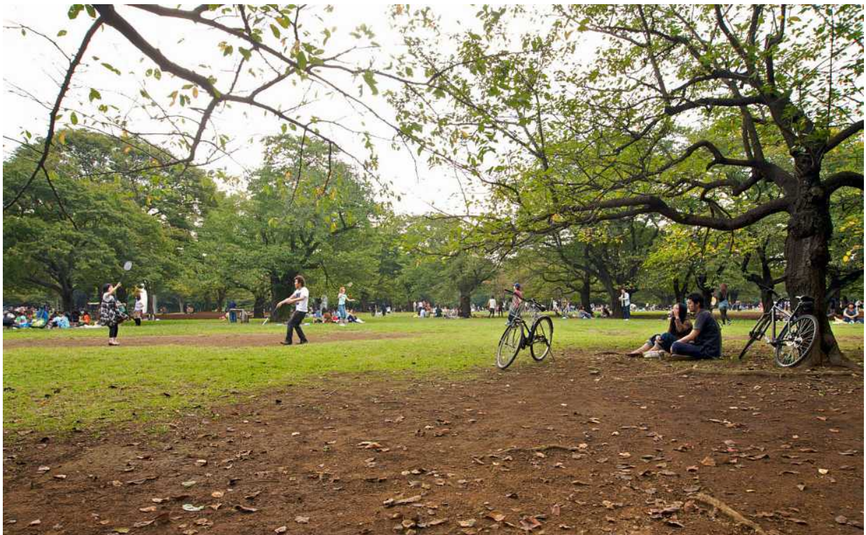
Activities in Yoyogi Park